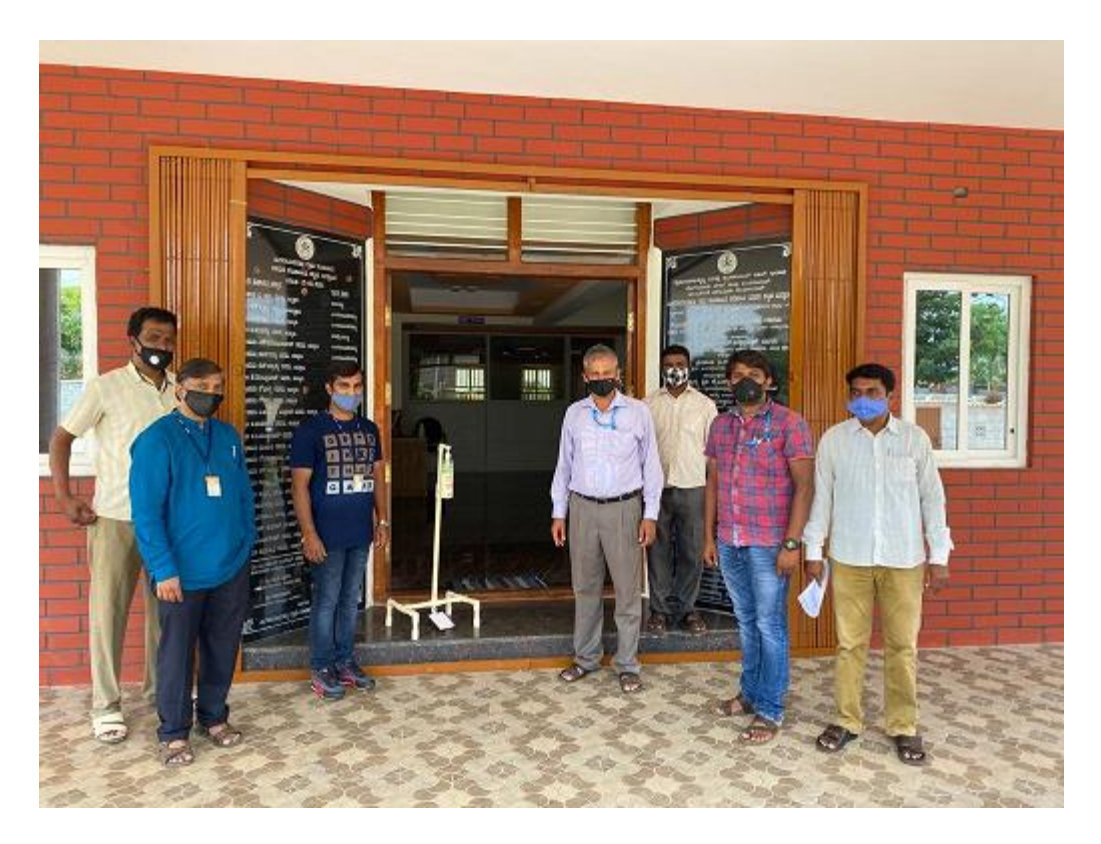
Donated foot operating Santtiser Dispenser to Singanayakanahalli Mandal panchayath office