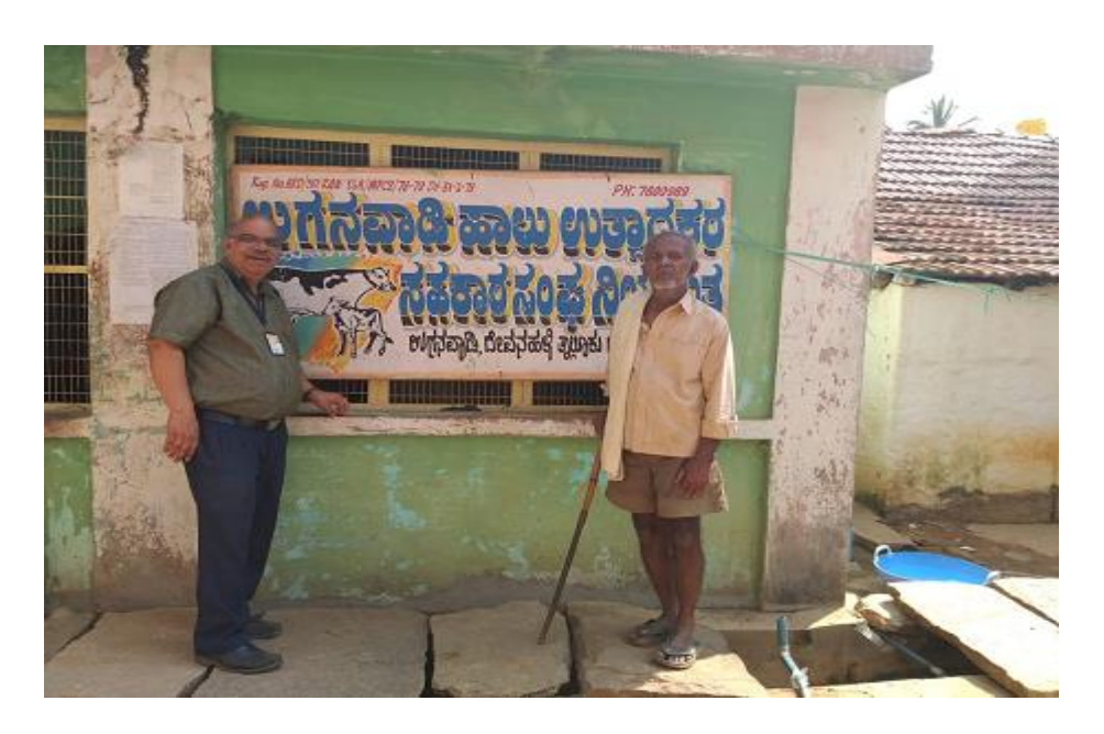
Interaction with Senior Citizen and villagers