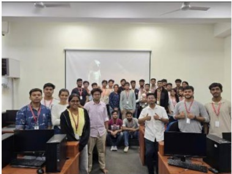
5) Technical Stall @ Anveshana 2025 on 28th March 2025,BICEP.We received “Best User Experience Award” for ARVR HUB with cash prize.