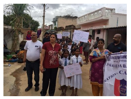
Awareness about health to the village people