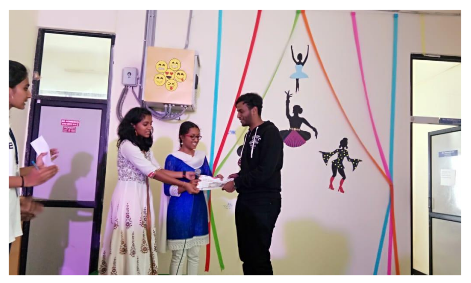
Receiving prize in BMSIT got Tallent Event