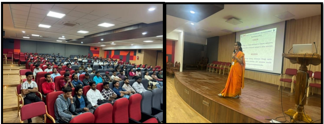
Students being addressed by Head of the Department