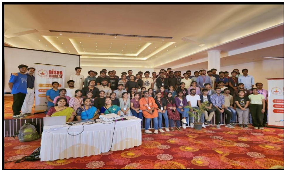
Students with organizers at Disha Bharat's personality development program