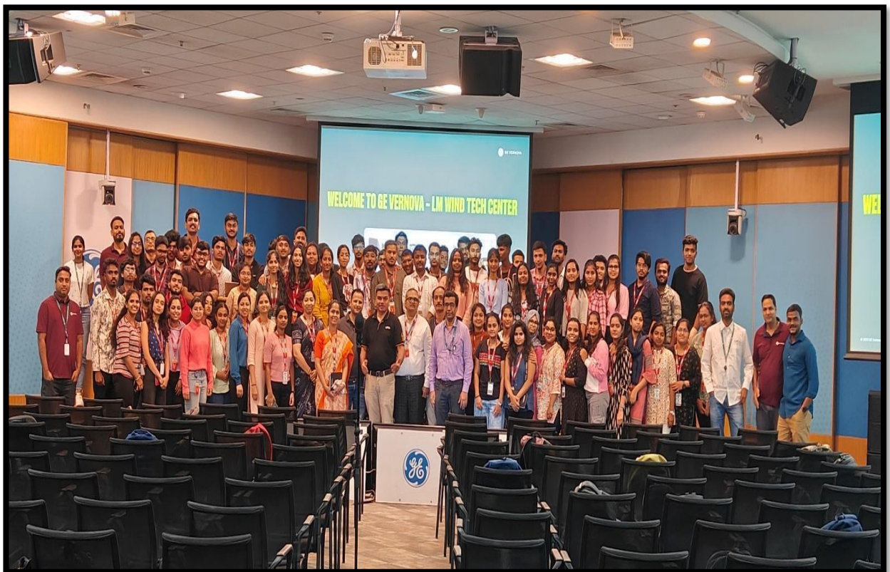
MCA team and students at GE Vernova-LM Wind Power