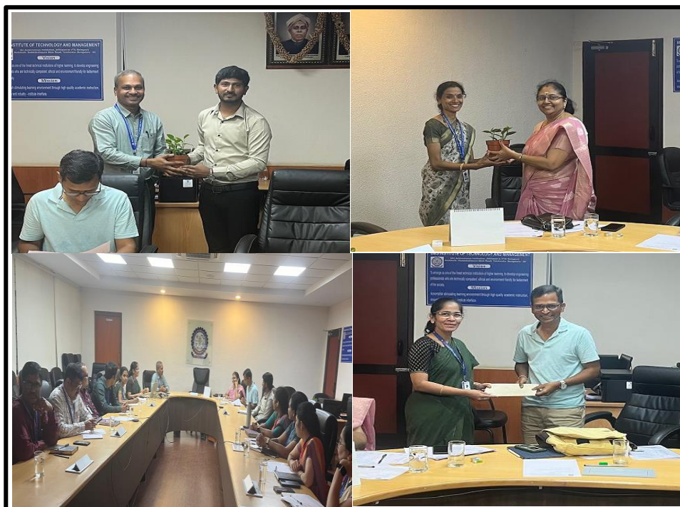
Snapshots of the 4 th BOS meeting