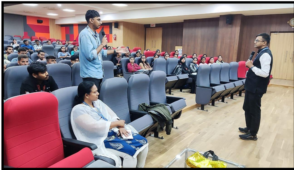
Students seeking clarification with one of the industry experts

a position at a company. The session concluded successfully with a Q&A segment where students had the opportunity to seek clarification and advice from the experts.