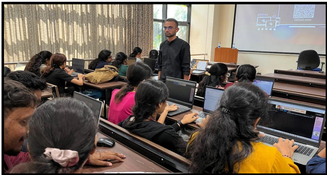
Interactive Hands-On Full Stack Development Workshop in Progress