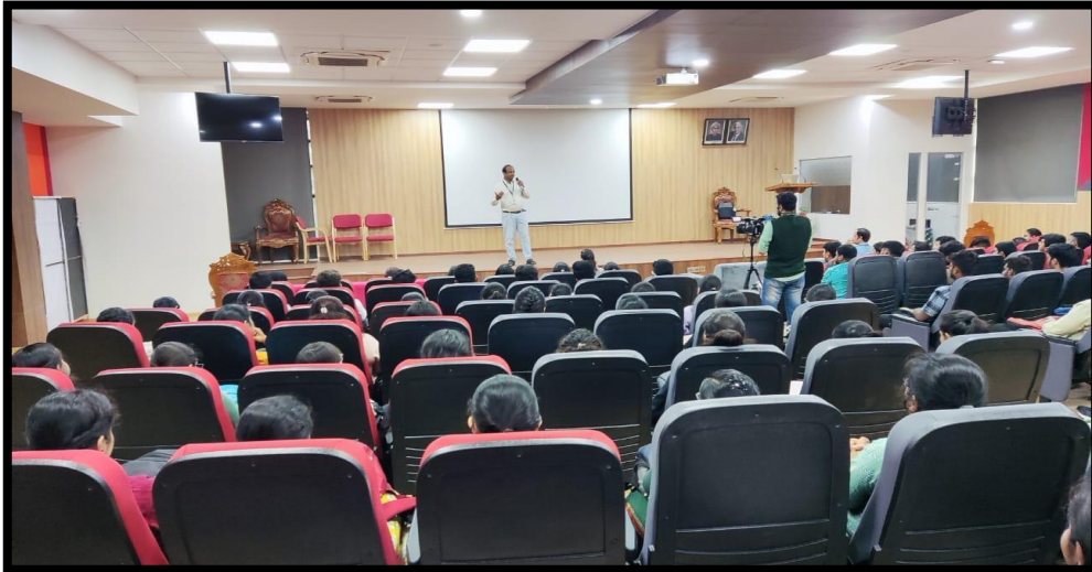
Students engaged during the session

preparation and communication skills. He highlighted the importance of communication, using examples to illustrate its significance. Overall, the session equipped students with foundational knowledge on interviews and communication, leaving them motivated in multiple ways.