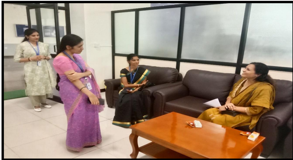
Parents interacting with Faculty Members