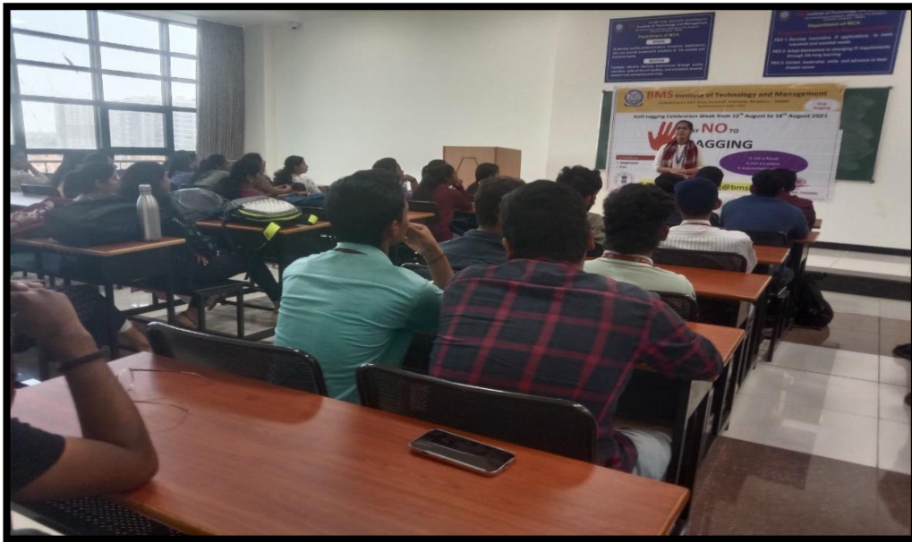
Speaker Engaging Students during the Session