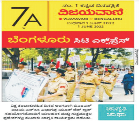
Tobacco and Drugs Awareness Drive Vijayavani