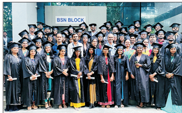
Outgoing students at the farewell