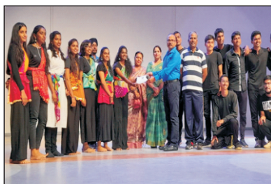
Group Dance: 1ST PLACE