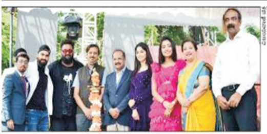
Utsaha Vaibhava - Vijayavani