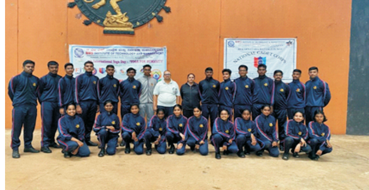
Celebration of 8th International Yoga Day on June 21st 2022