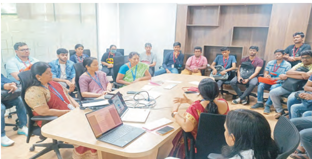
MoE's Innovation Cell, AICTE along with the Bureau of Police Research and Development

(BPR&D)(MHA) and Indian Cybercrime Coordination Centre (I4C)(MHA) have launched 'KAVACH-2023' a unique national Hackathon to identify innovative concepts and technology solutions for addressing the security challenges of the 21st century faced by our intelligence agencies. KAVACH-2023 is conceived to challenge India's innovative minds to conceptualize ideas and frameworks in the domain of cyber security using artificial intelligence, deep learning, and machine learning, automation, big data and cloud computing. This hackathon has 20 Problem statements related to the cyber security domain against which the innovative minds will be able to submit their ideas and compete against each other. About 4 teams have been selected through internal scrutiny to participate in the Kavach 2023 competition so far.