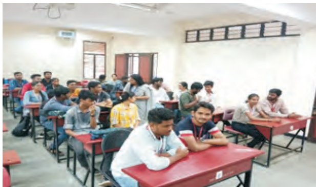
English Communication Skill Enhancement Programme: English Communication Skill Program for 2024 Batch.