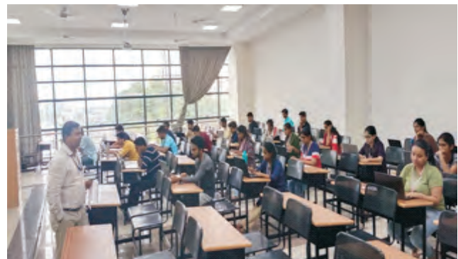
Coding Assessments on HackerEarth Platform: 4LPA, 7LPA Assessments conducted 2024 Batch Placement Aspiration Students.