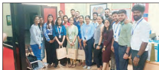
M./s Accorion Company: 2024 Batch Accorion Campus Drive Process on 08.09.2023.