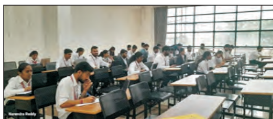
4 LPA TEST: 4 LPA Test for 2025 Batch on 01.09.2023.