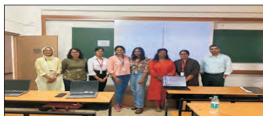
M./s Cognizant: TPO and Students attended on 07th September 2023 Cognizant Digital Nature Technoverse 2023 at Mysore.