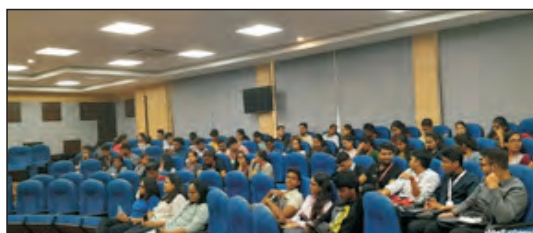
M./s Epsilon: 2024 Batch Epsilon Campus Drive Process on 04.09.2023