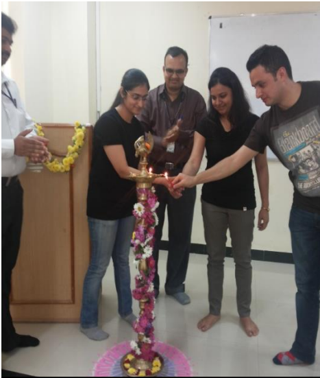
Figure-1: Inauguration from Alumnus