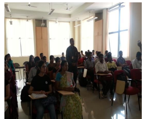
Figure-6: Audience participated