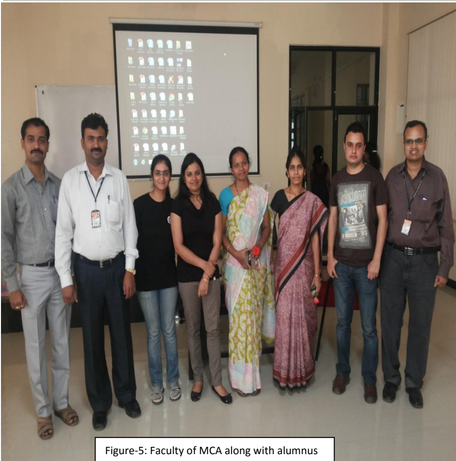
Figure-5: Faculty of MCA along with alumnus