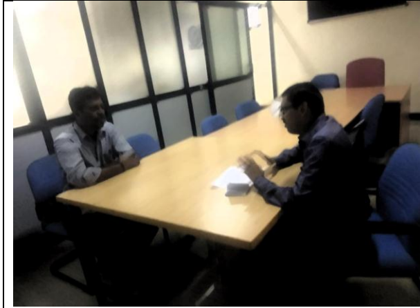
Proctor and parents discussion