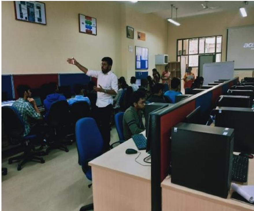
Hands on Web development