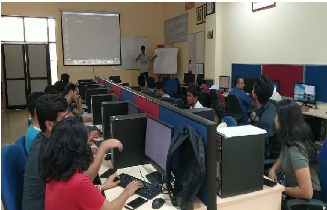
Hands on Web development