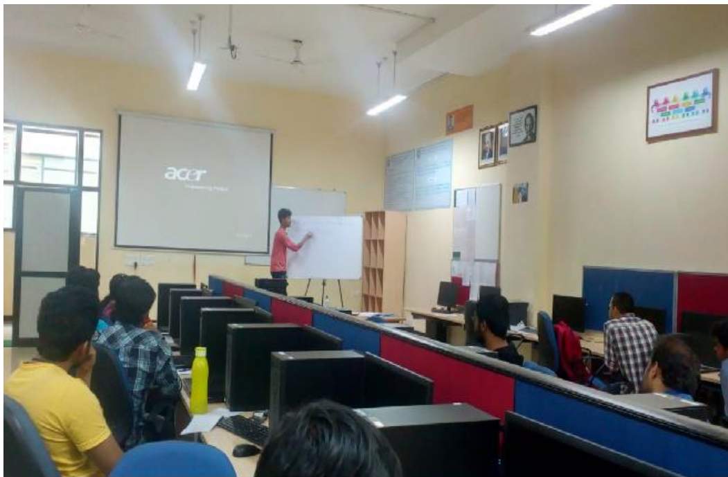
Hands on Web development