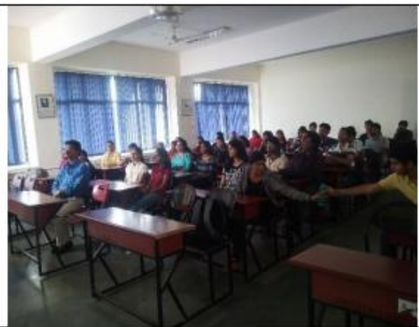
Aranya's talk under progress