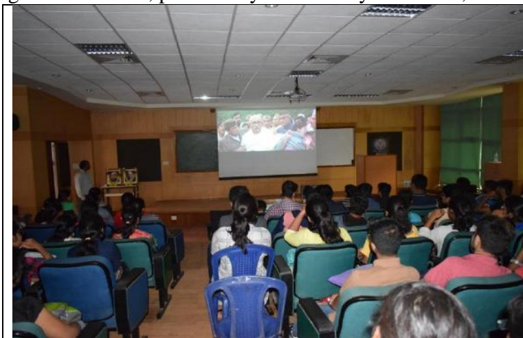
Students watching GANDHI movie, an activity under Universal Human Values